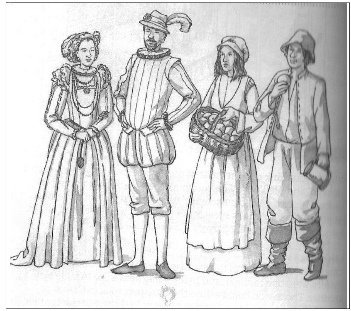
Any similar sketches or descriptions are acceptable with suitable atonements. Basic sketches will also be accepted.