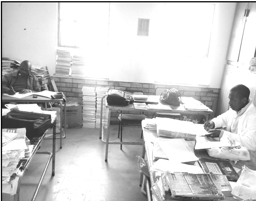
(Ithathwe kuvimba wabevi)

QAPHELA: Phendula yonke imibuzo usebenzisa amazwi akho, ngaphandle kokuba ucelwe ukuba ucaphule.